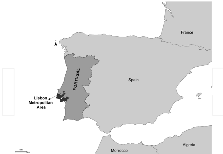
Fig. 1. Lisbon Metropolitan Area, Portugal